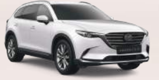
Mazda CX9 2020